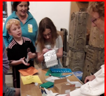
Fun and Crafts for the youngest members at Teddy Praise