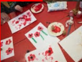
Children at Lo:Go preparing their Remembrance themed artwork